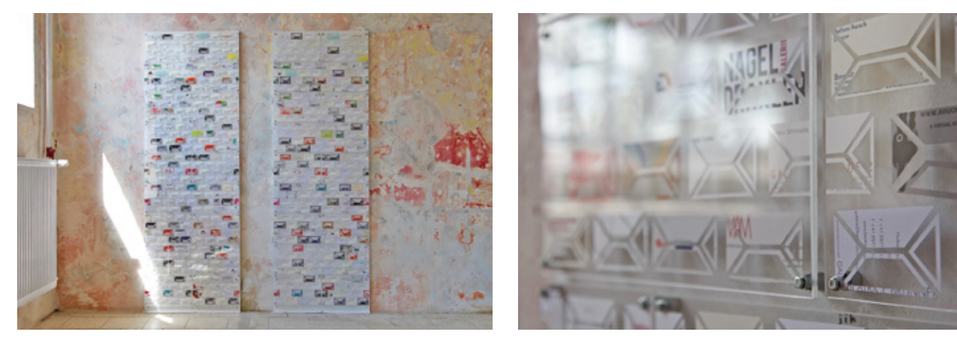
monos no.2 / 2019 / business card, plexiglass, magnet, screw, wooden panel