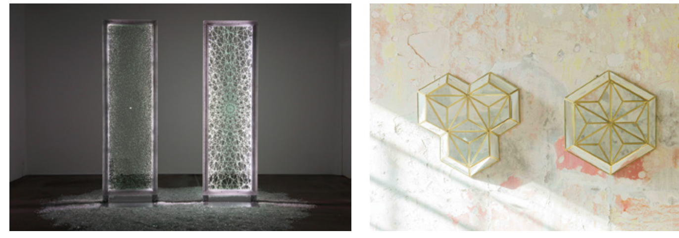
Exhibition View: Solo Exhibition 'tear' (2016) / TEZUKAYAMA GALLERY - Main Gallery