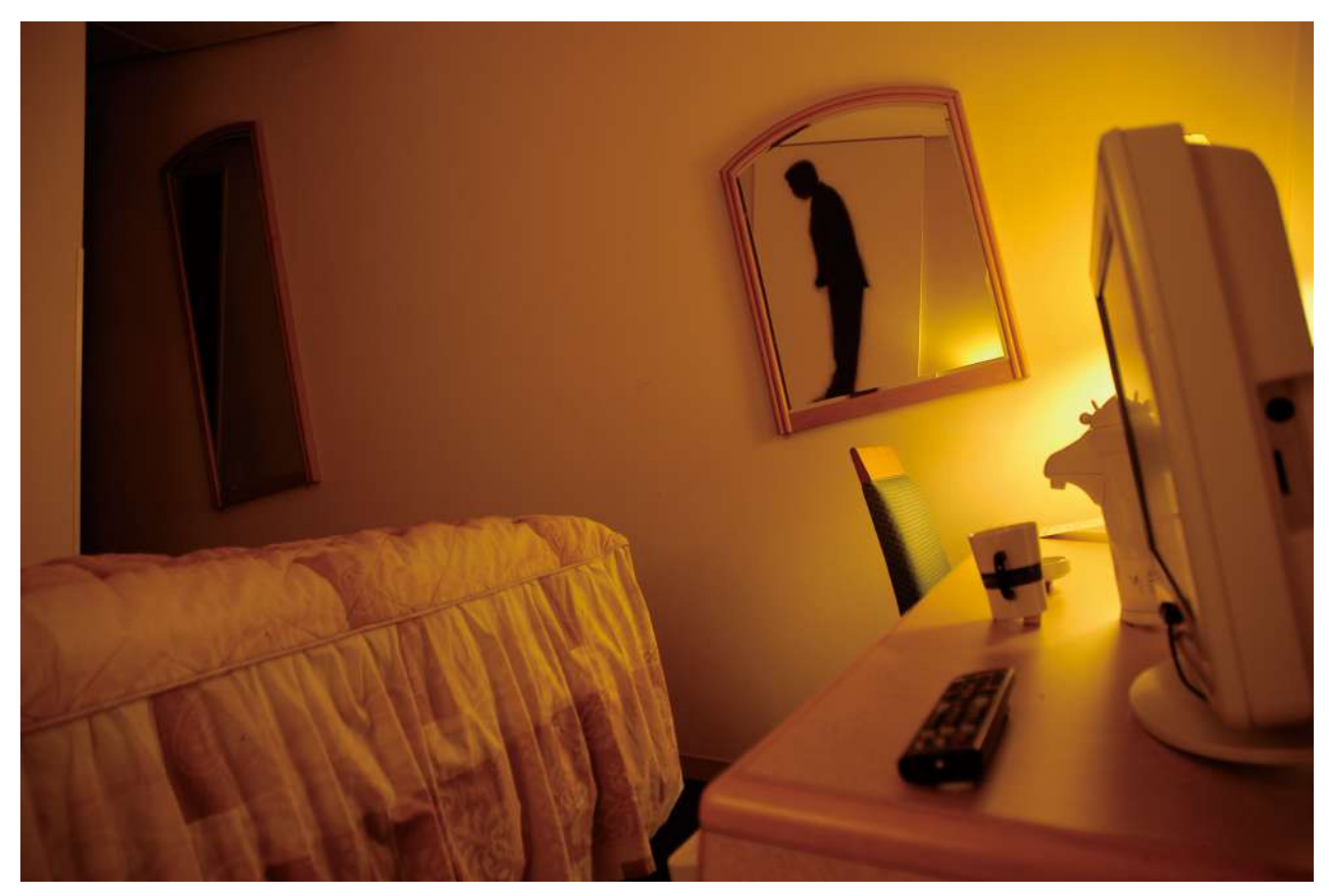
Installation View of Yuuki Tsukiyama Solo Exhibition at Hotel Granvia Osaka(ART OSAKA 2013), 2013