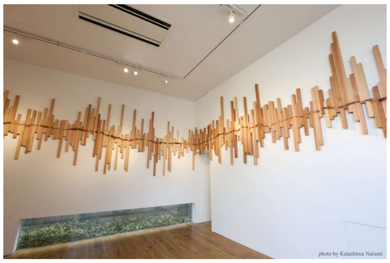
Installation View of Yuuki Tsukiyama Solo Exhibition 'Taruki Fiction' at GALLERY ASHIYA SCHULE, 2015