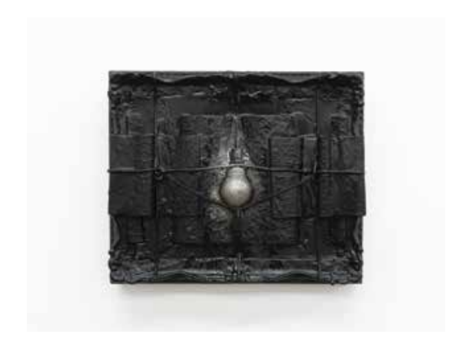
Wrapped Memory 2020 bronze, stone, lead H42.1 x W51 x D13.8 cm