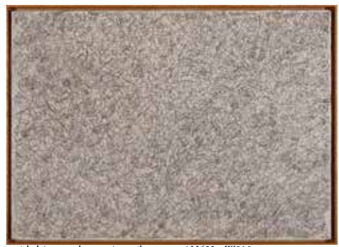
untitled / year unknown / pencil on paper / H653 x W910 cm