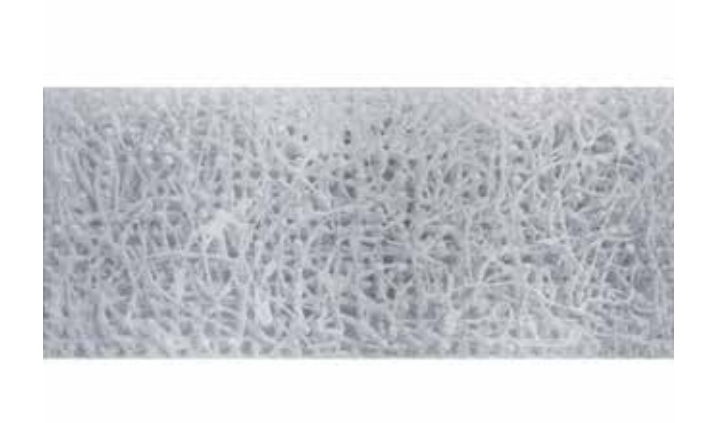
(13-7)~{\rm ONE:NUMBER~31} 2013 photographic paper on polycoat panel, resin, glitter, Intaglio on photo, peral paint H126 x W291 cm