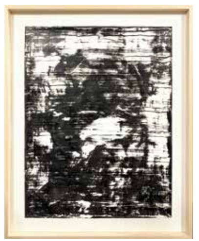
木片 / 2018 / acrylic on charcoal paper / H65 x W49.5cm(sheet)