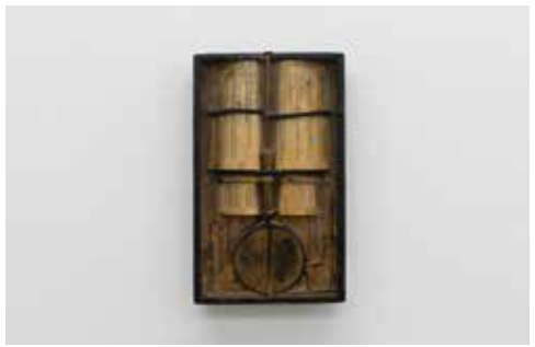
Wrapped Memory Book Magnifying Gold (A) / 2020 mixed media / H35.5 x W21.5 x D 7cm