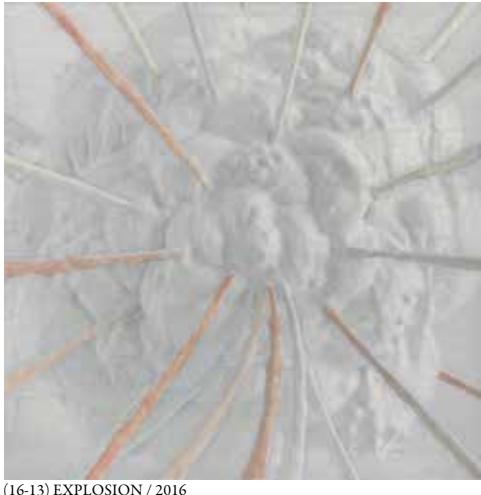
(16-13) EXPLOSION / 2016 photographic paper on polycoat panel, resin, peral paint / H280 x W280 mm