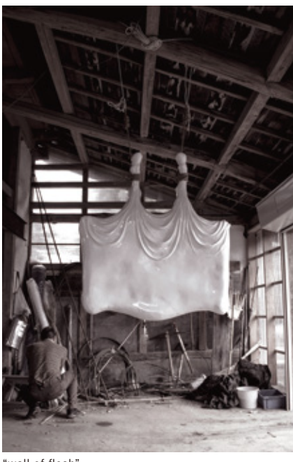
"wall of flesh" 2017 / FRP