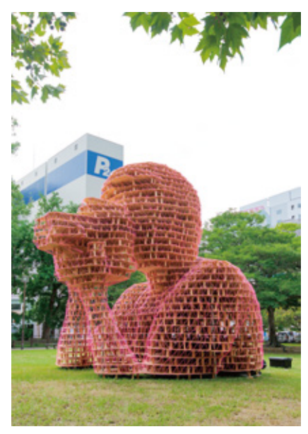
"pathfinder sculpture" 2023 / cord, plywood, nails