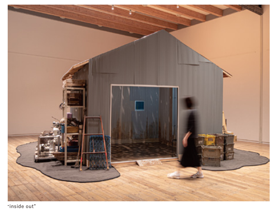
2020 / Borrowed items from the foundry, borrowed items from Wooden pattern maker, tinplate, monitor, lumber