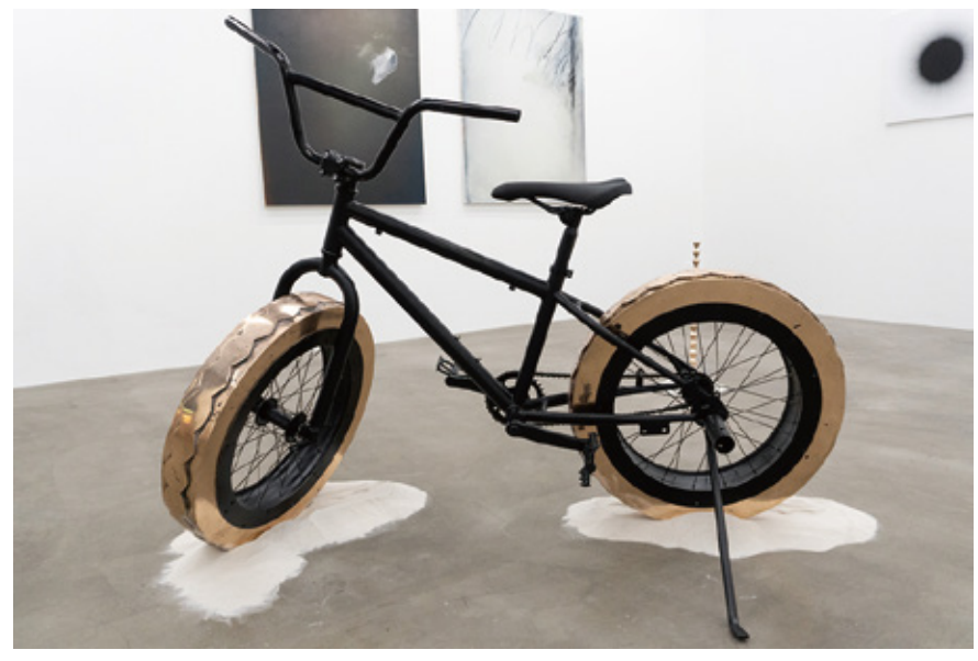
"live log" 2022 / BMX, Bronze, sand casting