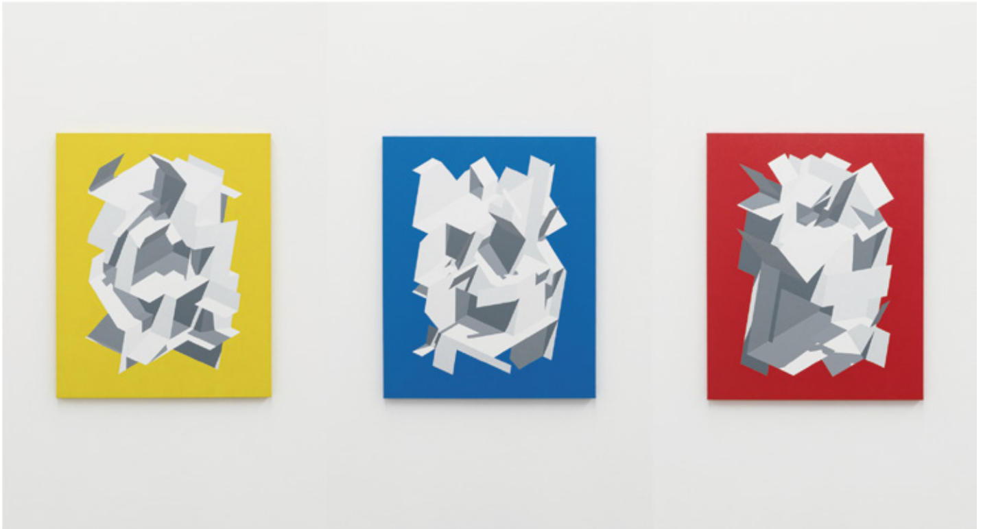
Untitled / 2023 / acrylic on canvas / H803 × W652 mm *each size