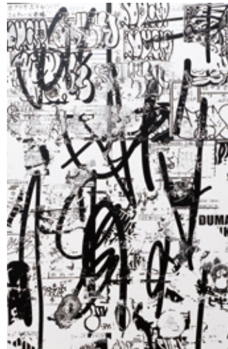
Left: Untitled 2023 acrylic on canvas H910 × W1167 mm